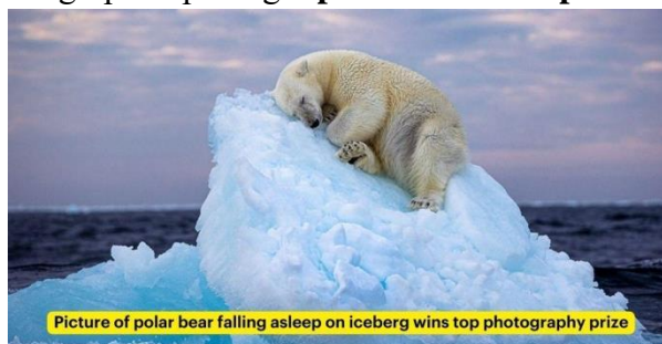
Picture of polar bear falling asleep on iceberg wins top photography prize